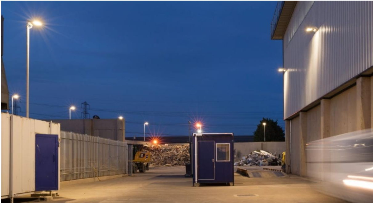
Figure 4.1: Example lighting in an industrial area

4.2.5 This approach is standard practice on modern street lights where poor low/high pressure sodium lights (with no control) have been replaced by light emitting diode (LED) lights; in some cases the light beams can be modified to only illuminate certain areas. Wherever possible, lighting installation components (lamps, control gear, luminaires, control systems etc.) shall satisfy the criteria detailed within the Energy Technology Criteria List set by the Carbon Trust in the Energy Technology Criteria List, Revision 1 (June 2021) published by the Department for Business, Energy & Industrial Strategy.